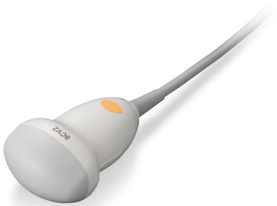
Small Footprint Mechanical 4D (9CV2)