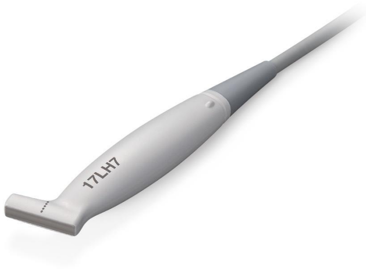
22 MHz Ultra-High Frequency Hockey Stick (i22LH8)