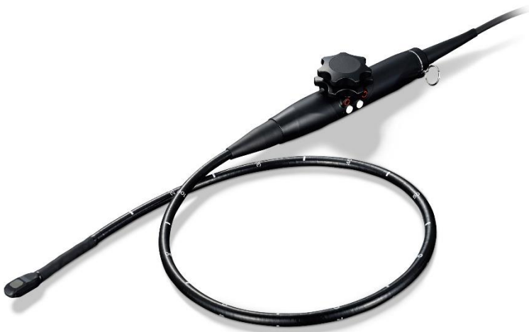
4D-TEE / Volume Matrix (i6SVX2)