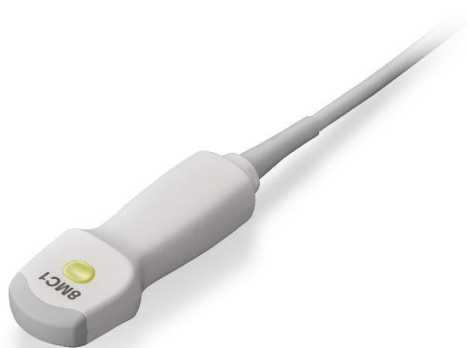
33 MHz Ultra-High Frequency iDMS Linear (i33LX9)