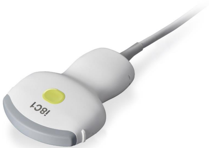
Single Crystal iDMS Convex (i10CX1)