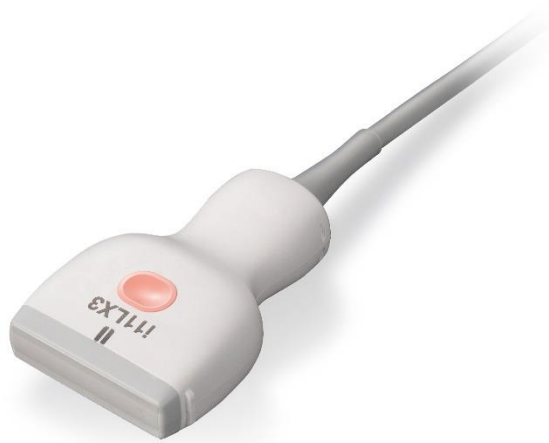
Linear iDMS (i11LX3)