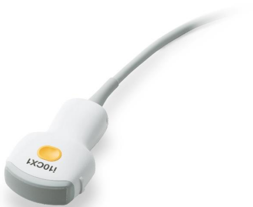
Single Crystal Convex (10C1)