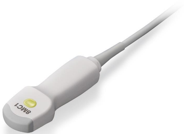
17 MHz Hockey Stick (17LH7)*